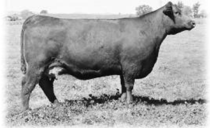
Royce's Sensational 14, full sib to lot 12