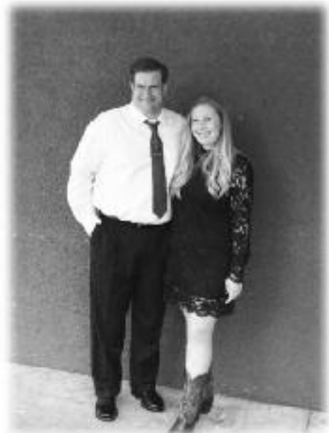
Law School Graduation

McPhee Rewarding 4895 has it all together. Check out his great suite of performance figures. Starting with a -1.5 BW EPD and WW and YW in the top 3% and 5%. Milk EPD in the top 1% and Marb EPD in the top 4%, CW in the 7% and REA in the top 12%. Don't forget Gridmaster in the top 4% too. This Trophy son is just like his papa- He can do it all. Get your Reward with this bull.