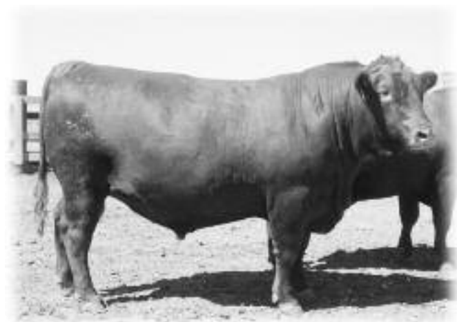
MCPHEE DIRECT TICKET 4856

Anna's Tally is a handsome son of Brown Commitment, who has a great balance of performance traits. Tally has a -1.1 BW EPD and explodes to a 100 YW EPD along with a Marb EPD that ranks in the top 6% of the breed. He is well muscled and long bodied, all while being well balanced. Give him a look.