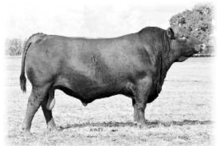
ROSE'S GOOD ONE 53

Rose's Good One 53 was the other bull selected by Alta Genetics to go into stud from our 2014 sale. He is proven calving ease going back several generations. Uniquely Good One offers a whole lot more. He is deep sided in the rib and flank and wide down the spine. He is a moderate framed stud that has extreme length of body and eye appeal. His carcass traits all rank in the top 25% of the breed, and are sure to get you those high dollar premiums when you sell your calves. These are the traits that are the most heritable and Good One has got you covered there. SEMEN AVAILABLE THROUGH ALTA GENETICS