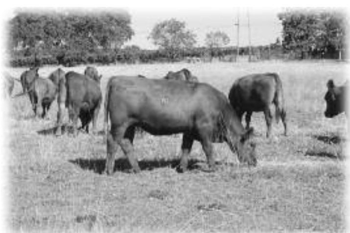
ANNA SORORITY 82