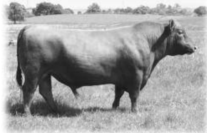
ROYCE'S DUN RIGHT 44

Royce's Dun Right 44 our young herdsire that packs it all into one stylish eye catching package. It's a rare chance to find a bull that can dominate the show ring and still get out and work. This bull does that and a whole lot more. He offers a complete EPD package across the board. Dun Rights progeny are proving to be performers too, with his entire progeny having 9 EPD's or better averaging in the top 25% of the breed. With their Grid Master and MARB EPD's averaging in the top 6%. He has been used on heifers and cows alike and each set of calves continue to impress. He makes calving seasons so enjoyable to go out and find these thrifty low BW calves that have gotten up and nursed already. This is a young herdsire that has a bright future in our herd and the breeds. He is certainly an impact sire that you can count on his progeny to be profitable.