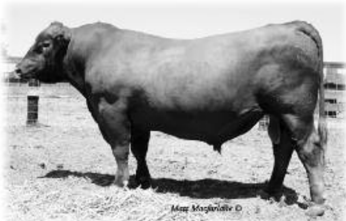
MCPHEE REMARKABULL 4669

McPhee Remarkabull 4669 is a highly maternal herdsire who has a performance packed pedigree. His dam is no stranger to raising herdsires, as she is also the dam of McPhee Done It who is a herdsire at Pelton Red Angus in Kansas. Remarkabull is a long bodied stylish looking bull. He has the performance match, with a 114 WWR and 116 YWR and 109 for IMF. These are all traits we see him pass along to his offspring. A sire that will get your calves noticed by the packer and keep them wanting more. He boasts a complete suite of carcass EPDs ranking in the top 7% for Marb 0.82 and 25% REA 0.42 Remarkable is proving he has what it takes to get his calves noticed. SEMEN AVAILABLE