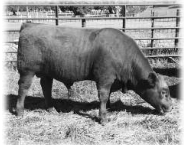
MCPHEE AWARDING 448

McPhee Awarding 448 is a real Trophy. Look at the range of performance data. Starting with a 68# BW and a -1.7 BW EPD, then Gridmaster, WW, YW, and Milk all in the top 1%. His Marb is in the top 4%, CW in the top 2% and REA in the top 10%. It doesn't get much better than this Trophy son. He's a double bred Brown Commitment. He was really awarded a trophy.