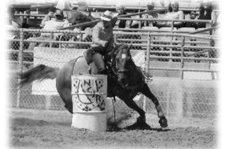
Rose & Wino

EPD Averages for Non-Parents Under Two Years of Age