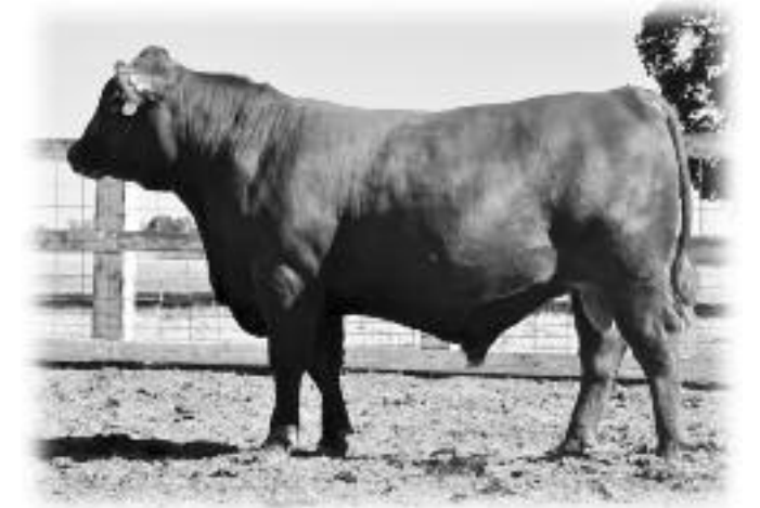
MCPHEE JUST REWARDING 4900

McPhee Just Rewarding 4900 is a McPhee Trophy 36 son. Trophy was the highlight of our 2014 sale, selling to Alta Genetics for $25,000. Trophy progeny are highly sought after, and for a good reason. His daughters are just in production, and certainly have impressed us. Just Rewarding ranks in the top 1% for WW, YW, and CW EPD, and has a Gridmaster EPD in the top 6% of the breed. Give this guy a try, you will be justly rewarded.