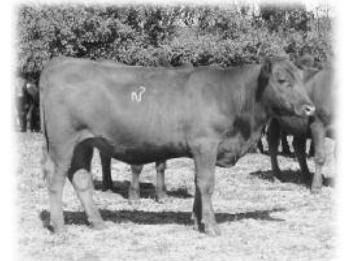
MCPHEE GOLDEN 5373