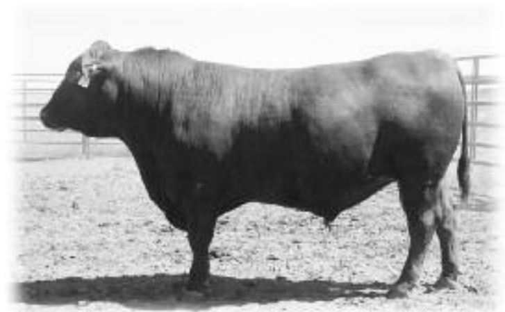
MCPHEE RED RIDER 64

McPhee Red Rider 64 is a son of Brown Commitment X7787, a sire that stamps his progeny with his good looks and great performance. Red Rider 64 has just a 62 # BW and a -2.0 BW EPD. Your heifers will like him. He ranks in the top 2% of the breed for Marb EPD and in the top 11% for Gridmaster. He is deep made and wide topped. Red Rider is moderate but thick through and through.