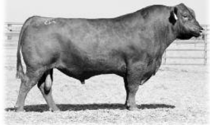
BROWN COMMITMENT X7787

Brown Commitment X7787 Is a sire that gets it done by sireing calves that are standouts from calving ease to growth. He is a herdsire that not only has a suite of EPD's to be admired, but he has the performance to back it up. With a 1.66 MARB EPD this ranks him at top 1% of the entire breed. With over 200 progeny Brown Commitment stamps his offspring with his phenotypically good looks and muscle and performance. This is a sire that will increase your herd profitability in just one calf crop. SEMEN AVAILABLE