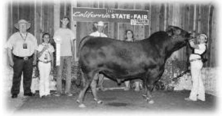
ROYCE'S CROWN ROYAL 57

Royces Crown Royal 57 is a top shelf Bull for sure. This eye catching Bull started out with just a 63 # BW with a -1.5 BW EPD. He ranks in the top 7% for Marb EPD. Crown Royal is wide backed and loaded with muscle and length. When he walked into the ring at the Ca State Fair, the judge commented "Looking at this Red Angus bull makes a cattleman excited about what the Red Angus breed has to offer." He is a ¾ brother to McPhee Trophy 36. His mother is a maternal sister to Royce's Sensational 14, the $54,000 high selling animal at the 2016 Mile High Classic sale in Denver. This is a strong maternal line with proven performance 3 generations deep. We used him on heifers last fall with great success. Whether keeping replacements or selling steers, Crown Royal will put profit in your pocket.