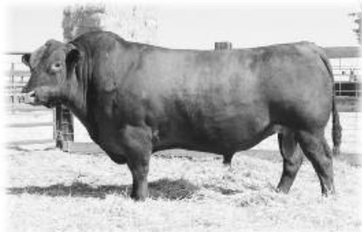
MCPHEE NEW REVELATION

McPhee New Revelation 4360 is our premiere multi trait sire with his -2.8 BW EPD, and a 112 YW EPD ranking in the breeds top 20%. With over 200 calves on the ground, he offers the complete package. He is proven and also offers that maternal punch with a milk EPD of 36 and ranking in the top 2% for milk, 20% for MARB and 14% for REA. These are all the economically relevant traits that will put the dollars back in your pocket. You can't go wrong when you use New Revelation genetics in your herd. He is a moderate sized bull with loads of muscle and length of body and great feet and legs. SEMEN AVAILABLE