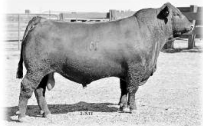
MCPHEE TROPHY 36